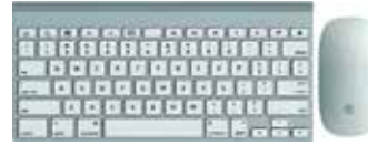
Wireless Keyboard and mouse