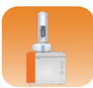
Optima Gas Chromatograph