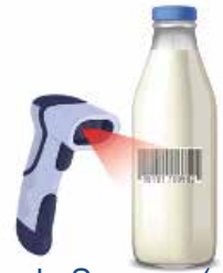
Barcode Scanner (optional) Easy sample date entry